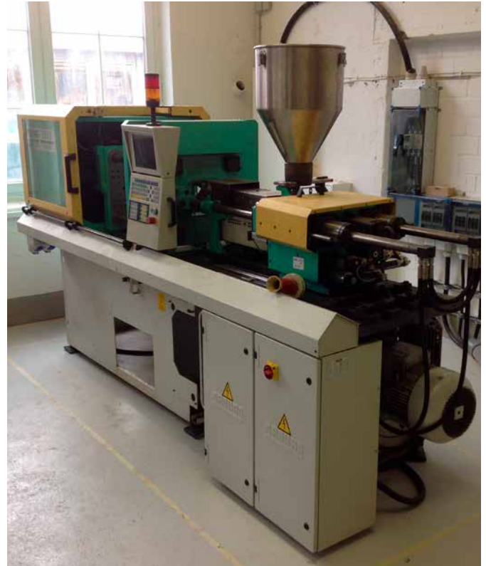
One of the three cooled injection moulding machines in the PolymerEngineering test lab

The first phase of the project involved water cooling of three injection moulding machines. Despite different basic conditions, the objective was to cool all three machines with a single chiller. In order to determine the right chiller for the job, Pfannenber's experts first analysed the local conditions and calculated the actual cooling demand as well as the required supply temperature. If it is only when the capacity of the chiller is optimally adjusted to the application, that is the only way to ensure smooth operation of injection moulding machines. Otherwise, with overdimensioning, there is the risk of higher electricity costs and reduced lifetime of the chiller, or of outages and costly downtime of the injection moulding machine(s) with underdimensioning.