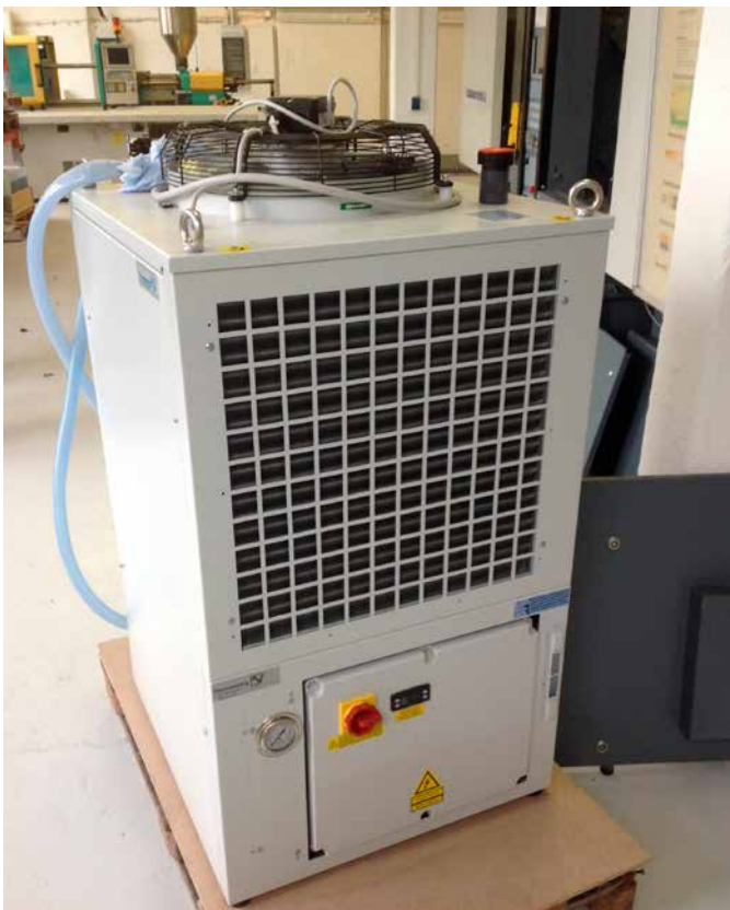
A type EB 130 WT CE STD chiller cools the injection moulding process of three injection moulding machines