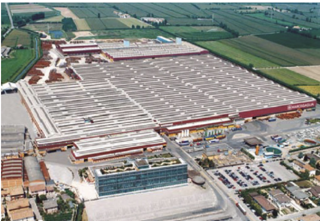
Aerial view of Gazoldo degli Ippoliti

It consists of 38 buildings of about 80 m x 100 m.