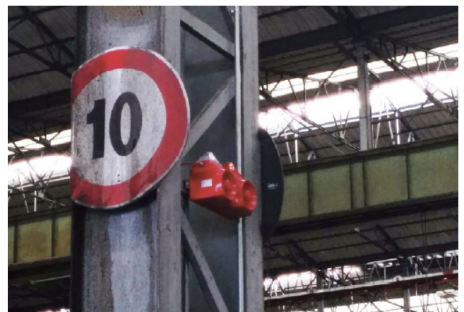
PA 20 and PY X-M-10 installed

Next stage in collaboration with the Marcegaglia's chief of plant security and the system integrator's CEO will be the extension of the same solution in other manufacturing sites - starting from Ravenna, where Marcegaglia has set up its by far biggest plant (spreading over a 540,000 m 2 surface, 225,000 covered) working as the nerve-center for integrated logistics as well.